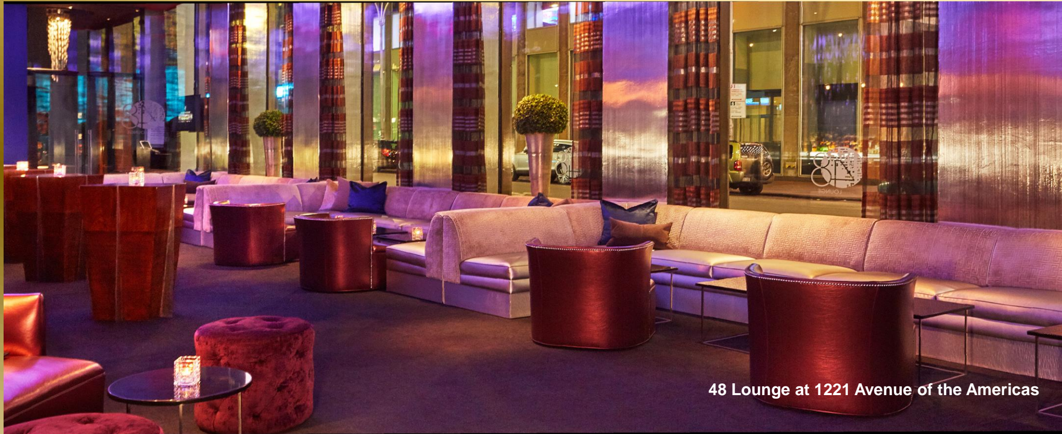
48 Lounge at 1221 Avenue of the Americas